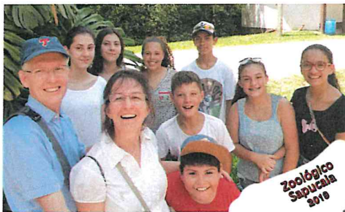
Youth at the zoo

With the church kids on summer break, the last two months were very busy. We spent extra effort on building relationships with our future adults around fellowship in the Lord. Hence, we had several special church activities that centered around the children and youth of our ministry.