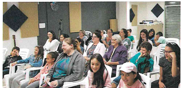
Tuesday night VBS at Victory Baptist

The week following the retreat we held two Vacation Bible Schools, one at each mission work. Through this ministry, we saw four children make professions of faith, and have new contact with three families.