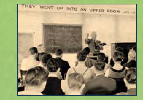
A "Preachers-Training-Preachers" in Church

A FOOT IN THE PAST, AN EYE ON THE FUTURE, TRAINING PREACHERS FOR BOTH NOW & TOMORROW Mirroring the Highly Effective Old Bible Baptist Seminary Begun 80 Years Ago