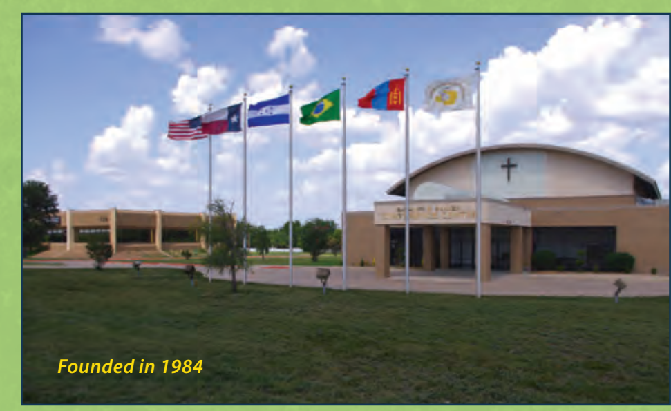
Promoting Evangelism, Church Planting, and Worldwide Missions