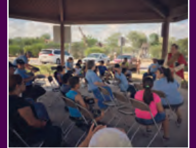
"And that from a child thou hast known the holy scriptures, which are able to make thee wise unto salvation through faith which is in Christ Jesus." II Timothy 3:15