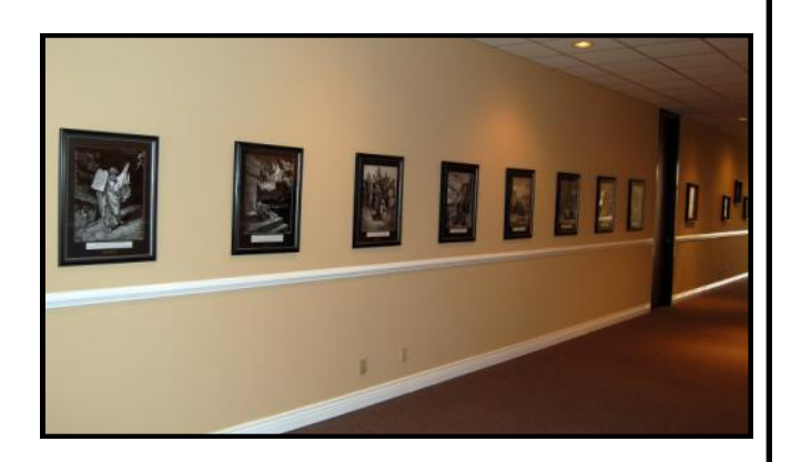
We are so thankful for the opportunity to improve such great facilities. Above, entry hall