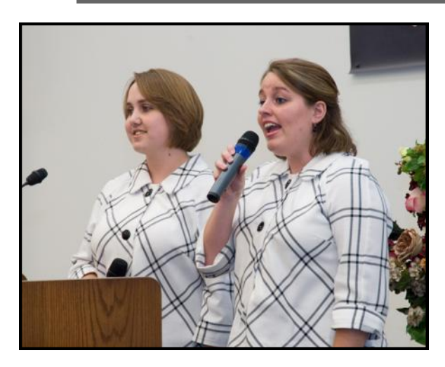
Inspirational Christ-honoring music

Wednesday, 7:00 P.M. - Service to be held at Worth Baptist Church, Fort Worth, Texas