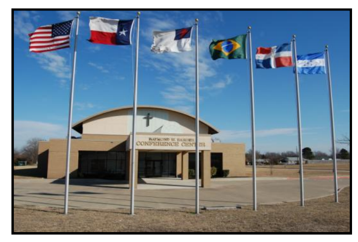
All services, except Wednesday evening, will be held at the Raymond W. Barber Conference Center.